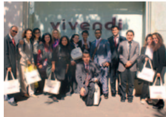
↑ Vivendi received a delegation of 15 young leaders from the Middle East and the Maghreb as part of the Fellowship Program of the United Nations Alliance of Civilizations.

Vivendi presented its strategic orientations in the area of sustainable development to some 15 young leaders from the Middle East and the Maghreb who came to Paris in September 2011 as part of the United Nations Alliance of Civilizations Fellowship Program. The Program's goal is to build ties