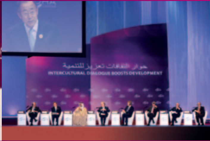
↑ The United Nations Alliance of Civilizations (UNAOC) held its fourth Annual Forum at Doha (Qatar), from December 11 to 13, 2011. Its High Representative, Jorge Sampaio, former President of the Republic of Portugal, led one of many discussions alongside Her Highness Cheikha Moza Bint Nasser, ambassadress of the UNAOC (above left). The Secretary General of the United Nations, Ban Ki-moon (above center), participated in the opening session of the Forum, attended by some 2,000 participants from 130 countries and many personalities (above right).

Vivendi and the United Nations Alliance of Civilizations share the ambition of making the promotion of cultural diversity and intercultural dialogue part of the worldwide sustainable development agenda.