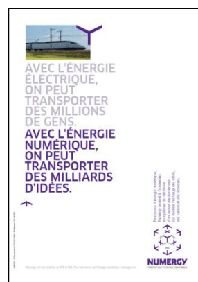
'Electrical energy' ad