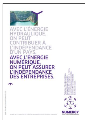
'Hydro-electric energy' ad