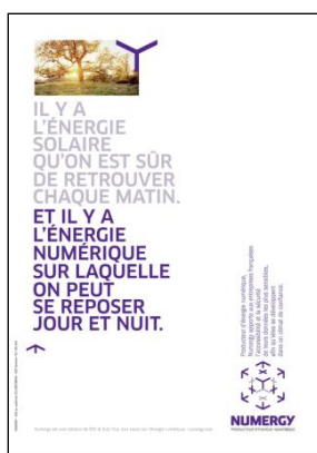
'Solar energy' ad

The corporate campaign will be rolled out across the national daily press, as well as specialist, business and Web media. It is aimed at opinion leaders, all businesses and players in the IT industry.