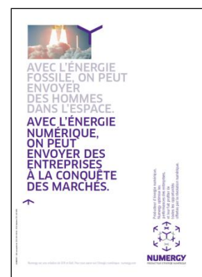
'Fossil fuel energy' ad

Logo and visuals are available from: www.numergy.com